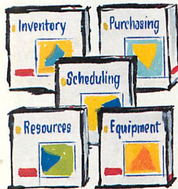
Stand Alone Tools

Many plants throughout the world have developed powerful computing and organizational infrastructures to "facilitate" the decision making process concerning their high-value capital assets. But, power has its price. These same plants are often bogged down by disparate systems, huge computer surcharges, painfully slow output, one decision maker and one systems expert.