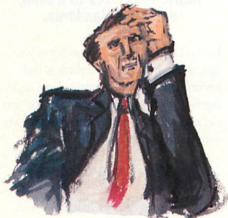
One Decision Maker